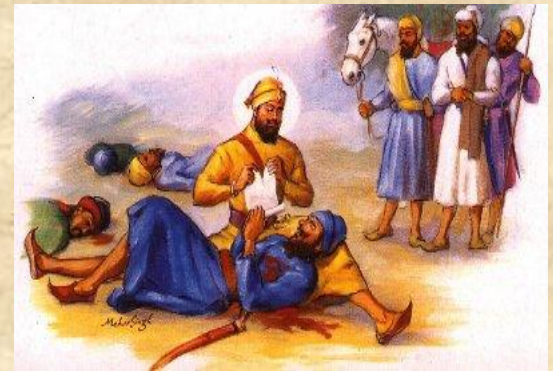
Bhai Mahan Singh asking Guru Gobind Singh Ji to tear the Badawa

May 20 (Sun.) – Homeless Langar Seva. Call 602 741 8021 for more info.